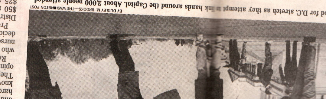
Hand hands for D.C. stretch as they attempt to block hands around the Capitol. About 2,000 people attended.

STREET CLOSINGS: Streets along the race course will be closed from 6 to 10 a.m. These include all of Ohio Drive, East and West Basin drives and a small stretch of Independence Avenue SW.