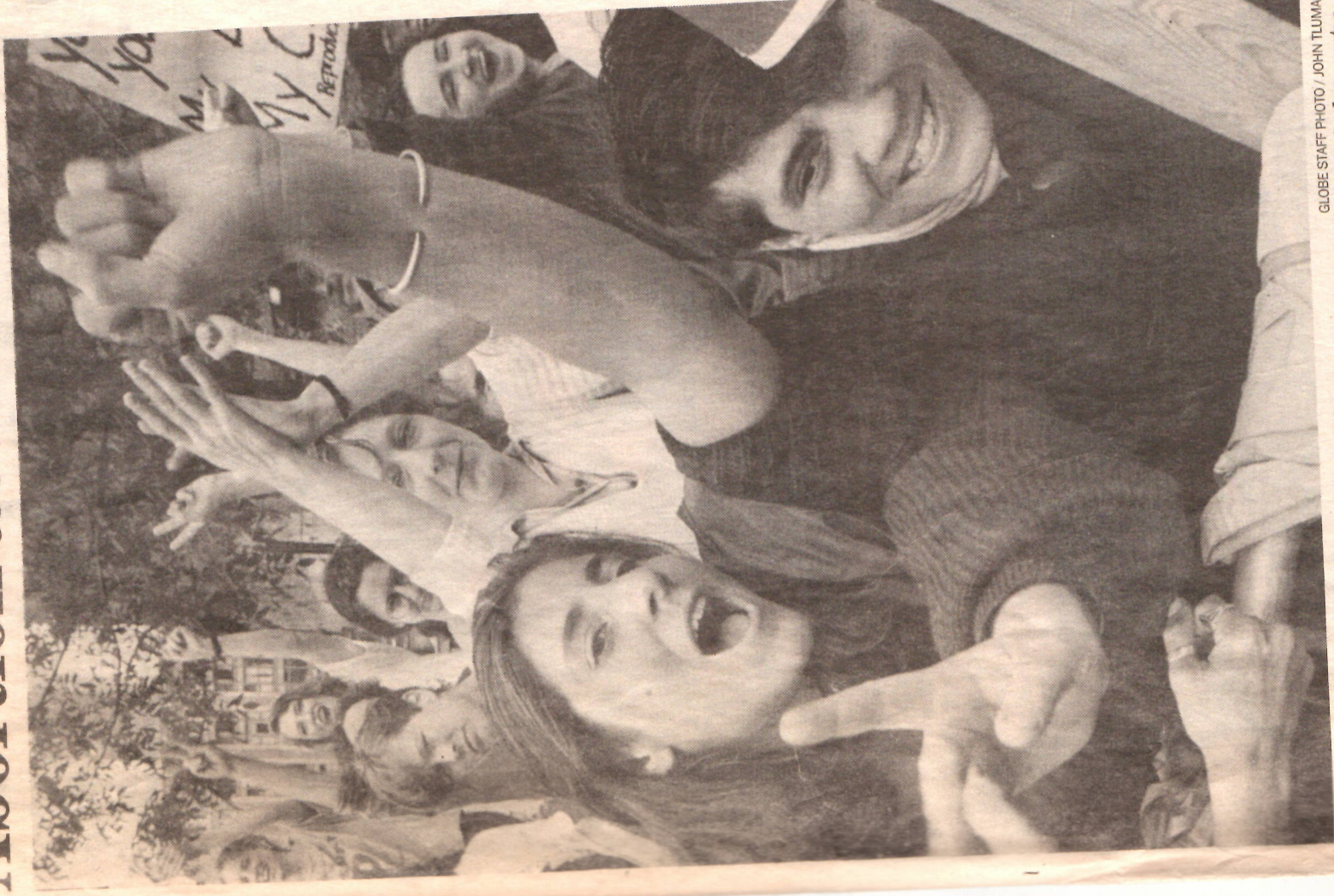
ABORTION-RIGHTS SUPPORTERS CHEER YESTERDAY AS ABORTION FOES WRAP UP THEIR DEMONSTRATION ACROSS TREMONT STREET FROM THE GYNECARE CLINIC IN DOWNTOWN BOSTON.

"We don't intend to get arrested, but we do intervene to save preborn children scheduled to die by abortion and that usually does lead to arrest," she said.