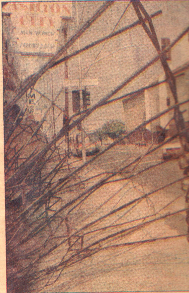
Two National Guardsmen patrol in front of a Sea

The Buffalo, Jan. 23, 1992, news column column carried a story on the event. The story was a positive one, but it was not as detailed as the one in the Buffalo News.