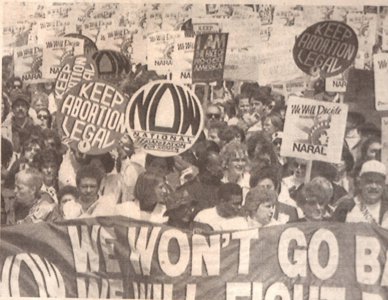
Abortion-rights demonstrators marching in Washington to proclaim that they oppose any rollback in women's rights.